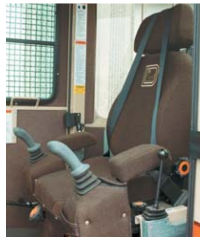
Comfort, easy-to-use controls & complete instrumentation are standard equipment.